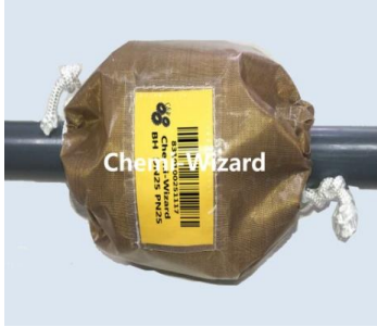
Chemi-Wizard® BH 泄漏保护套 Chemi-Wizard® BH Safety Shield